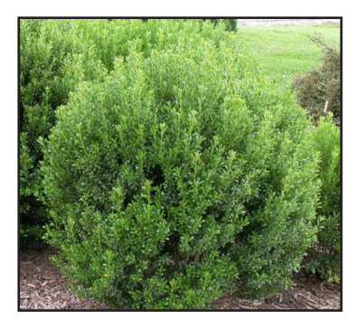
llex glabra 'Compacta