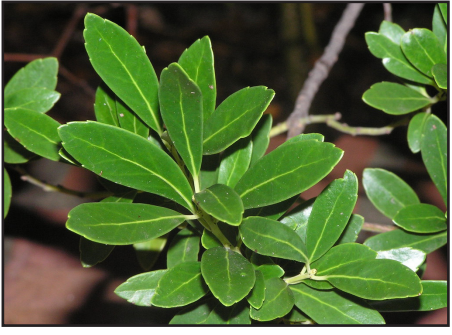
llex glabra leaves