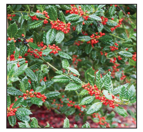
X 'Nellie Stevens'