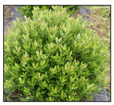
Ilex glabra Strongbox®