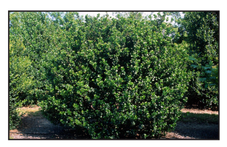
Many Blue Hollies are slightly roundish to squarish in shape. Examples of this type of growth habit include Blue Angel, Blue Prince, Blue Princess, and China Boy & Girl.