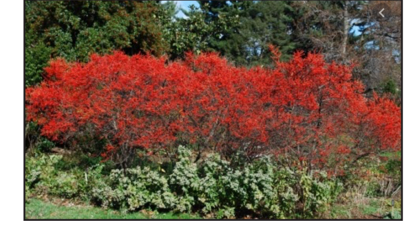
Verticillata becomes a loose woody shrub over time. 'Winter Red' grows up to 8' tall. Taller verticillata varieties work great in a naturalized garden or against a woodline for a naturalized transition plant. 'Red Sprite' only grows 3 - 5' tall and works well closer to the home. The effect of a mass of Winterberry in bloom can be absolutely stunning.