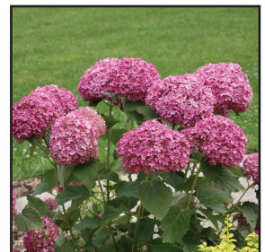
Invincibelle Mini Mauvette®