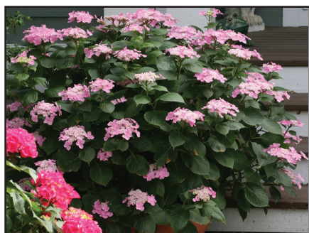
Let's Dance® Starlight

LP Statile sells as many as 4 different macrophylla serrata varieties through the year.