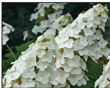
quercifolia 'Snow Queen'