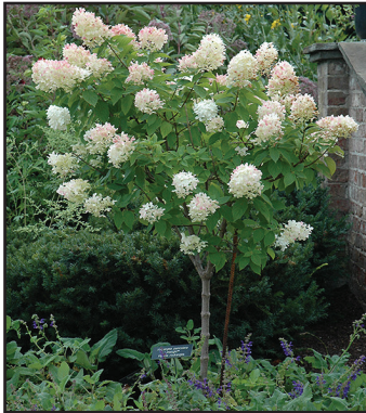
'Limelight Standard' (tree form)