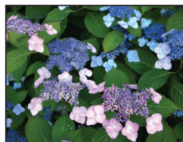
serrata 'Blue Billows'