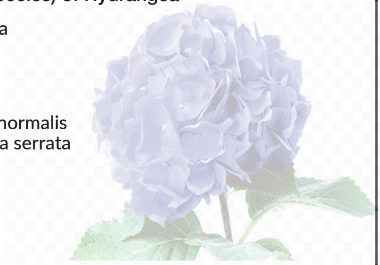
Hydrangea arborescens Invincibelle Limetta®