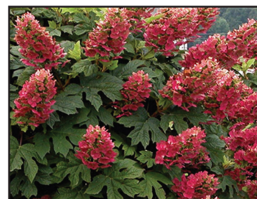
'Ruby Slippers' late summer to fall color