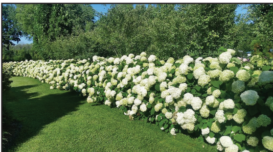
Annabelle Hydrangea Hedge

(Note - not all 6 varieties will be available at all times in both locations)