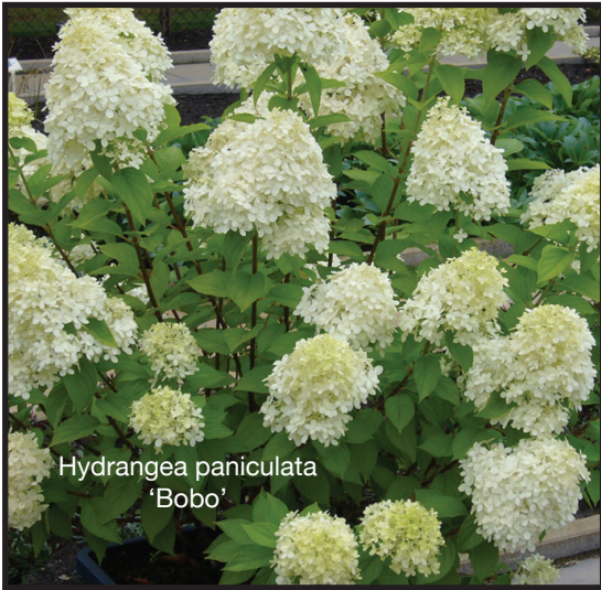
Hydrangea paniculata 'Bobo'